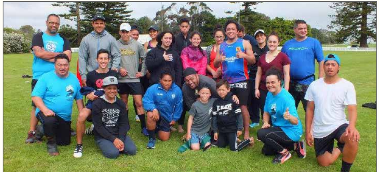
Kei Te Toi Ahurea eenei uri me eeteahi o nga kaiarahi