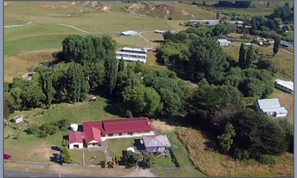
Te Aroha Marae