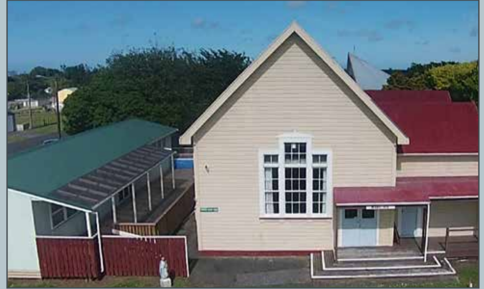
Te Wairoa Iti Marae