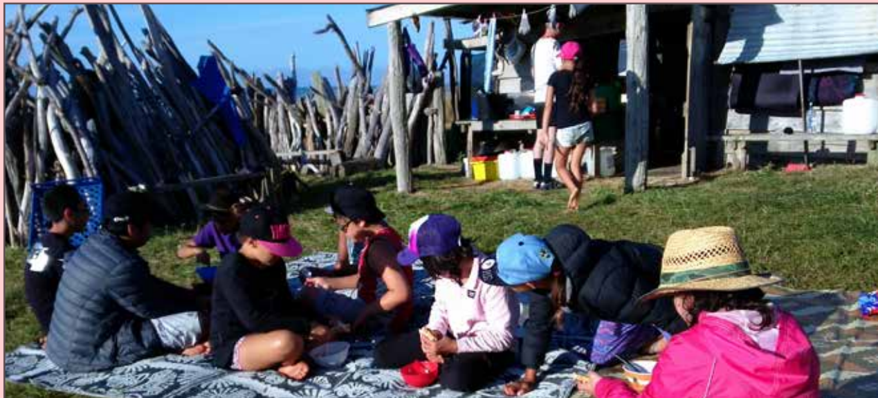
Kei te kai nga tamariki ki Herehere-i-moana