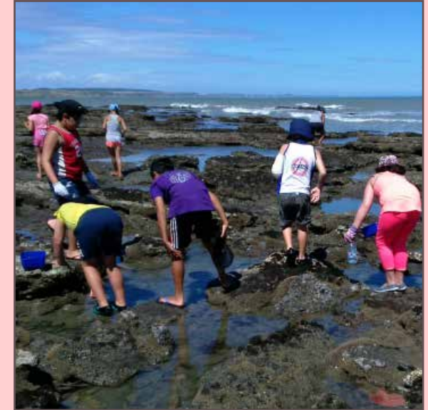
Kei te koha maataitai nga tamariki