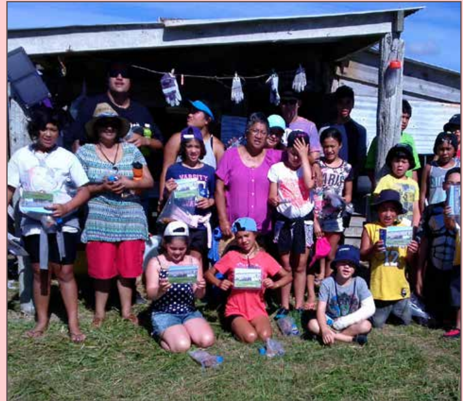
Kei Herehere-i-moana eenei kuia me aa raatou mokopuna