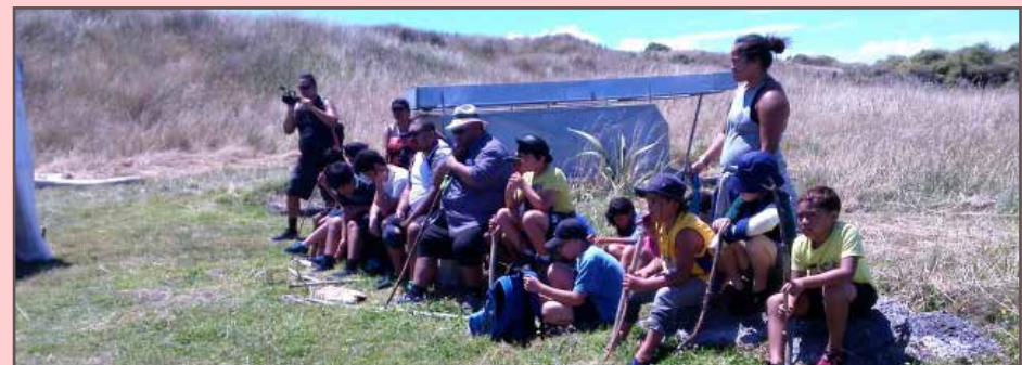
He waa whakataa, he waa hoki ki te kapo i ngaa koorero-o-mua