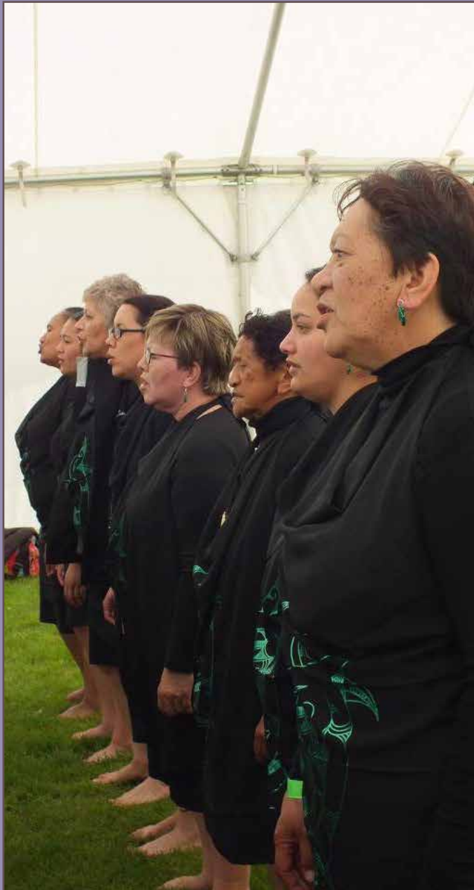
Ko te Kapa o Te Paahuki o te Awa o Waitootara