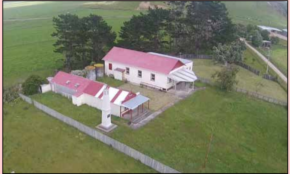
Te Ihupuku Marae