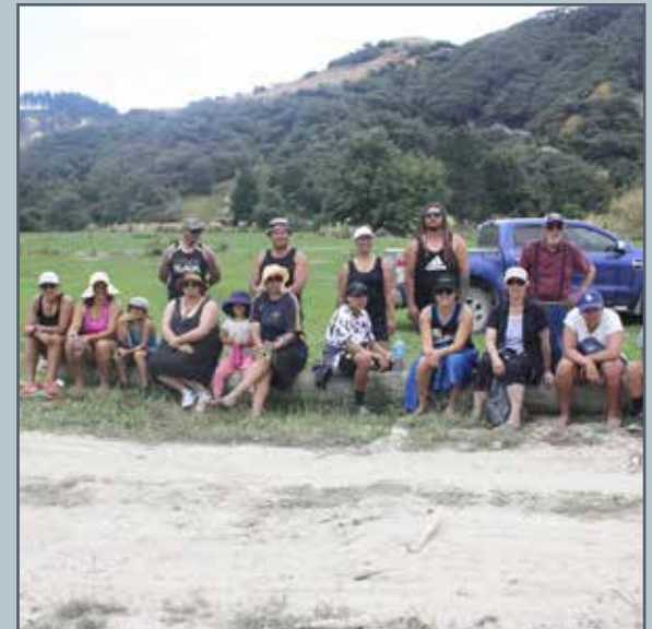
He waa whakataa kei Moumahaki Lakes