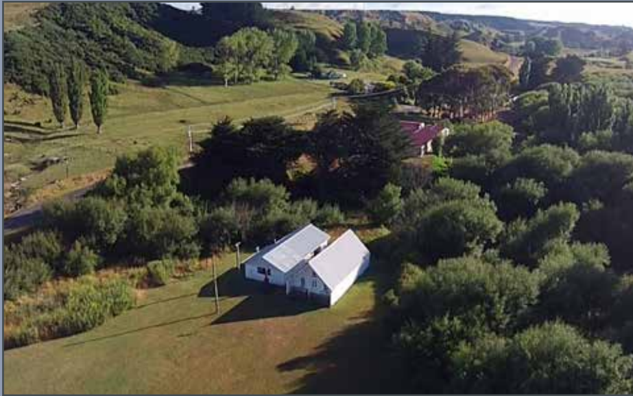
Kai Iwi Marae