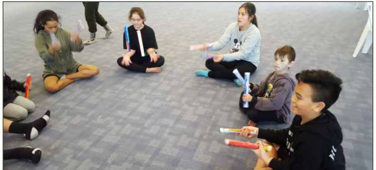
Kei Tauranga Ika eenei mokopuna e ako ana i te mahi raakau