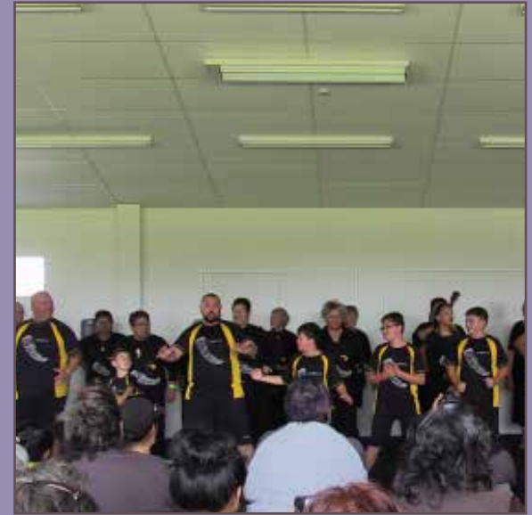
Ko te Kapa o Te Kei o Pahitonoa