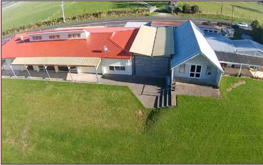
Tauranga Ika Marae